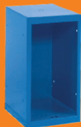
Primary Jr. Cubbie