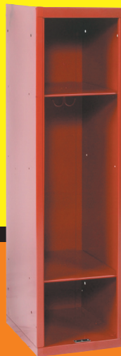
Primary II Cubbie