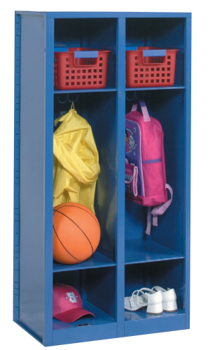
Primary II (2-wide unit)

Introducing Superior Fully-Framed All-Welded Cubbies. We have engineered this new line of cubbies specifically for elementary school and early childhood classrooms. Combining the high quality of our All-Welded lockers, design flexibility of our Hollow-T framing system and the added safety features required for this specialized market, we present four distinct models to meet children's personal storage needs. Superior Cubbies are backed by our written lifetime warranty.