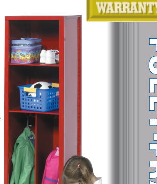
Backpack (1-wide unit)